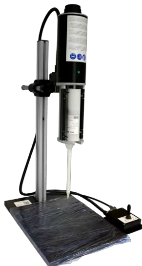
Bench top stand with hand switch

Dispense on/off lever valve & flow regulator. Optional footswitch.