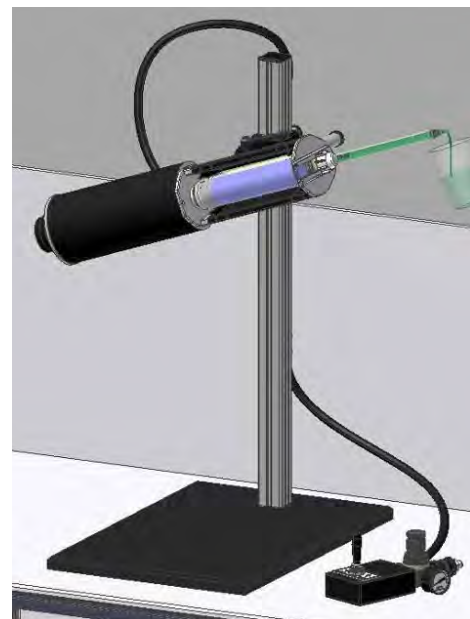
Swivel facility to prime mixer