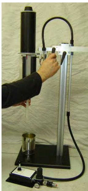
Adjustable vertical in/out and swivel